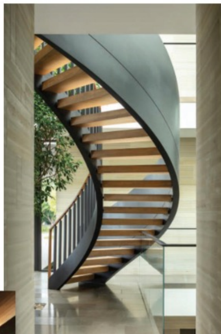
ABOVE Enveloping a tree, a curving steel-and-wood staircase sweeps upward in this South Bay Retreat which overlooks the Pacific Ocean.