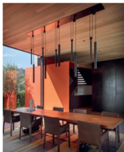
BELOW RIGHT Veev Design created this Light Box house in San Francisco. This is a house of layers, from the internal shear walls to the transparency of the glass enclosed bedroom.