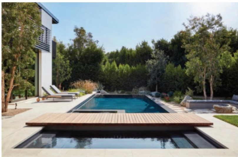
LEFT This Santa Monica house has a wooden bridge crossing the pool. A lush garden of Mediterranean trees and succulents fans the pool.