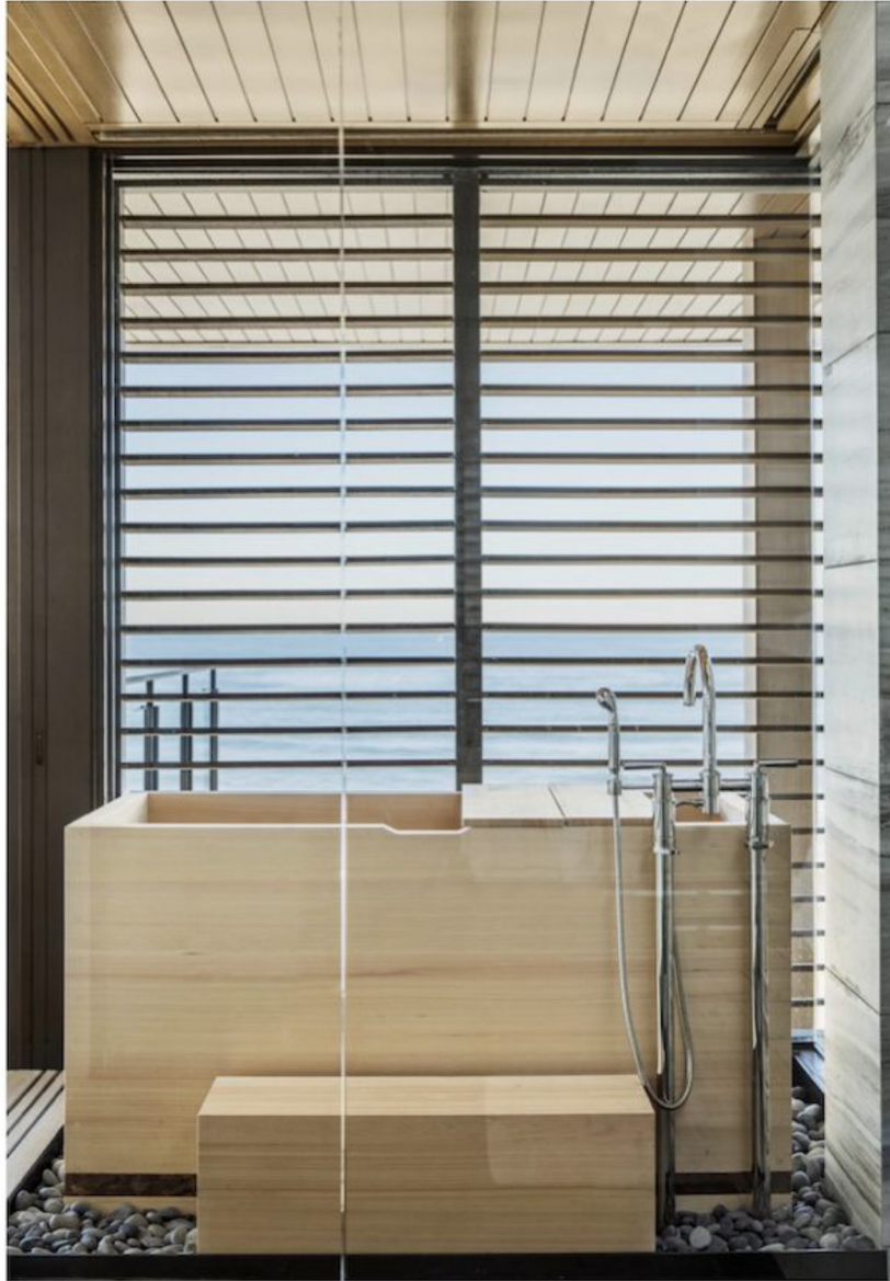
A bathroom in Manhattan Beach, California, by KAA Design Group, with a Japanese soaking tub by Bartok Design Co.

of light and air, the decision to provide every primary bathroom with generous fenestration is arguably among the most striking design choices. In select Woolworth apartments, Porcelanosa soaking tubs stand before huge windows, affording owners kingly bubble-bath vistas. For interludes of peace, contemplation, and self-congratulation, the experience has few rivals. Woolworth's luxurious bathrooms are part of a growing trend of turning the his-and-her bath into a sleek spa.