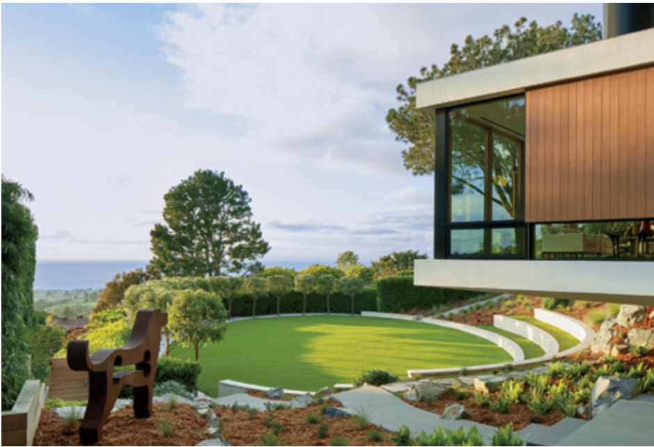
Top: An oval stretch of lawn forms an amphitheater for watching the sunset. Bottom: A view from the pool to the game room/guesthouse, with bocce court.