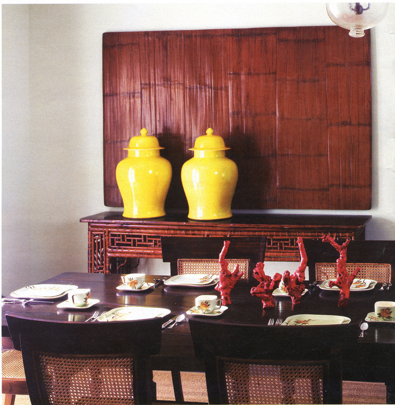
Left: In the master suite sitting room, Hutt uses a custom-made chaise lounge by Gwen Friss covered in fabric from Diamond Foam. Above: Hutt contrasts cool mint-green walls with rich colors. Bamboo sideboard from J.F. Chen with the clients' yellow urns. Table and chairs from British Khaki Furniture. Coral branches from J.F. Chen.