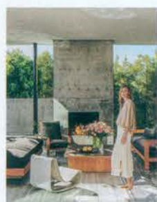
MARIA SHARAPOVA, WEARING A BASSIKE SWEATER AND CHLOÉ SKIRT, AT HER L.A. HOME. "VISION QUEST," PAGE 52. STYLED BY LAWREN HOWELL.

COMMENTS CONTACT US VIA SOCIAL MEDIA OR EMAIL US AT LETTERS@ARCHDIGEST.COM.