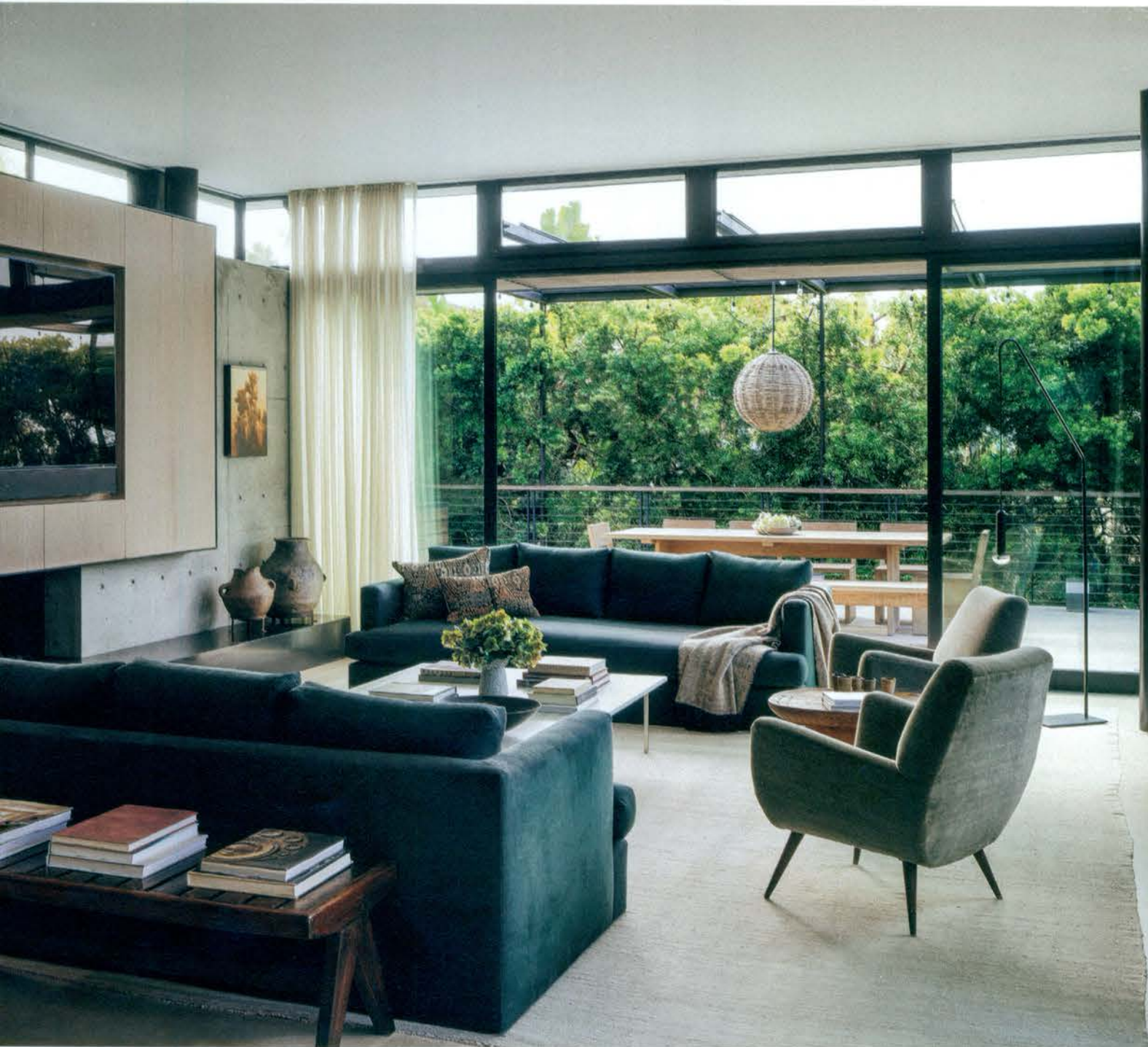
ABOVE VINTAGE ITALIAN ARMCHAIRS FACE DMITRIY & CO. SOFAS IN THE LIVING ROOM. ON SOFAS, PAT MCGANN PILLOWS; COURTNEY APPLEBAUM DESIGN COCKTAIL TABLE; BLEACHED JUTE RUG. OPPOSITE SLIDING GLASS DOORS FROM SEVERAL ROOMS OPEN ONTO THE POOL.

"I didn't grow up with lots of stuff around. For me, uncluttered means healthy. If you don't use something, you don't need it."