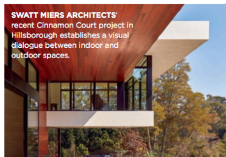
SWATT MIERS ARCHITECTS' recent Cinnamon Court project in Hillsborough establishes a visual dialogue between indoor and outdoor spaces.