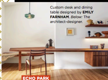
Custom desk and dining table designed by EMILY FARNHAM . Below: The architect-designer.