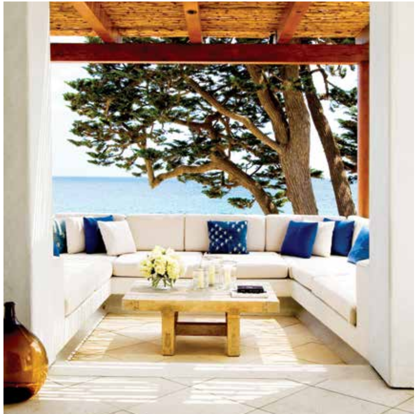
The blue yonder Panoramic vistas of sky and ocean greet visitors to this classic coastal home, located at the northern end of Laguna Beach, Calif.

KAA won the commission in a competition that engaged three architectural firms across California. “We did a preliminary design – we don’t usually do design competitions – but the clients were willing to pay the three firms for the initial work,” he says.