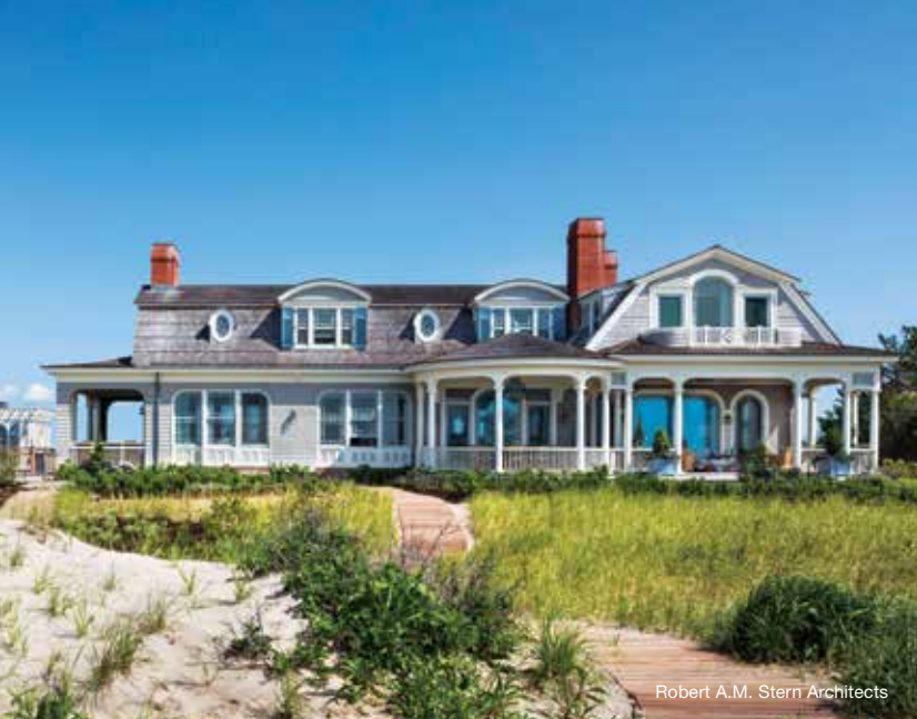
Robert A.M. Stern Architects