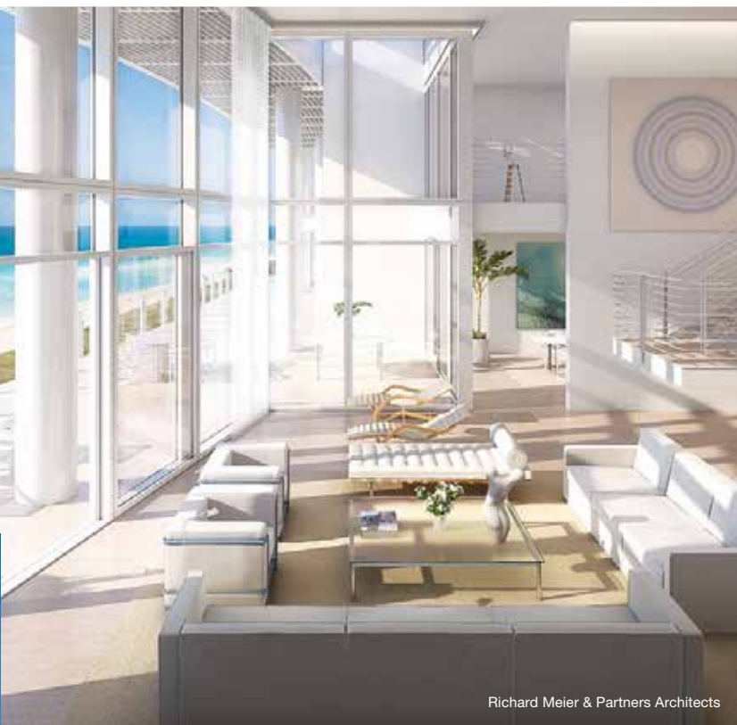
Richard Meier & Partners Architects